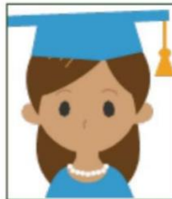
Public four-year university tuition $7,220