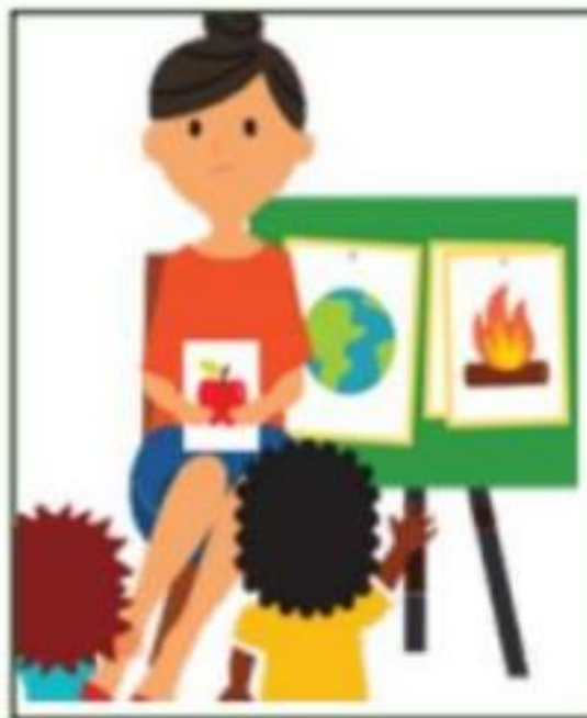
Center-based infant care $9,254