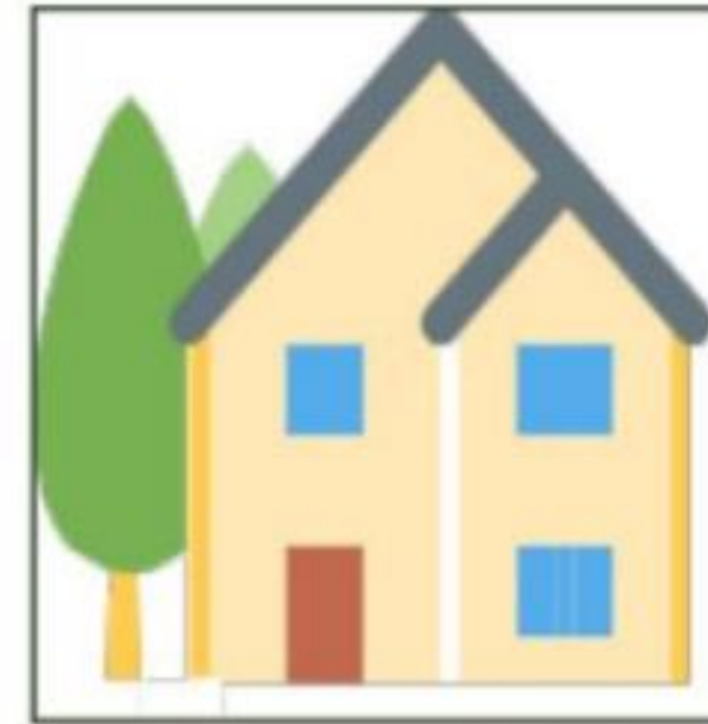
Average annual mortgage payments $15,132